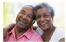
Commitment to serving our membership