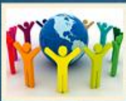
Building Stronger Communities with the power of Health Care