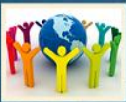
Building Stronger Communities with the power of Health Care