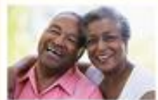
Commitment to serving our membership

Since 2011, MACHC has successfully developed over $53 million in opportunities for Community Health Centers in Maryland and Delaware. Membership in MACHC provides a full complement of benefits and services including